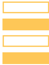
Change of direction PR