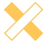
Wrong direction PR