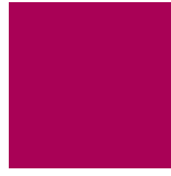
Short route track continuation GR