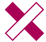
Wrong direction GR